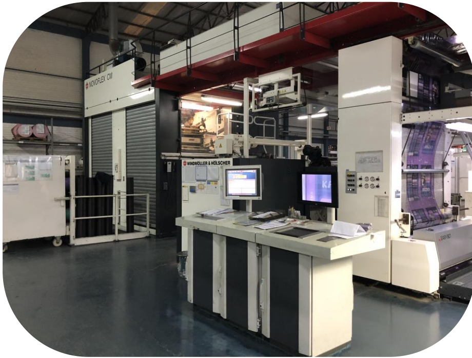
Process optimization: At Incoplast, they appreciate the know-how transfer and the consultants' distinct ability to "listen".